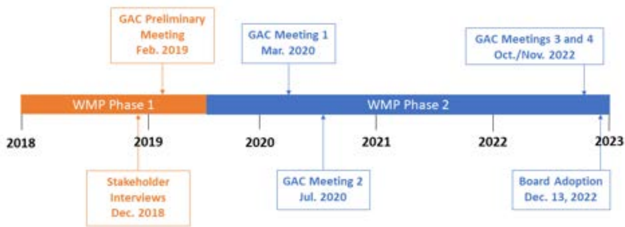
Figure 1. Water Master Plan Phases and Outreach